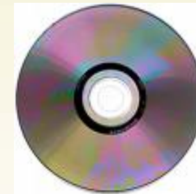
CD must be able to be read

ArcGIS Explorer – Free Download http://www.esri.com/software/arcgis/explorer